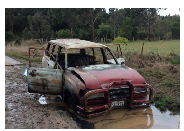
Remains of the unprepared