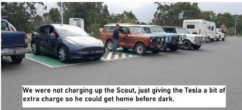
We were not charging up the Scout, just giving the Tesla a bit of extra charge so he could get home before dark.