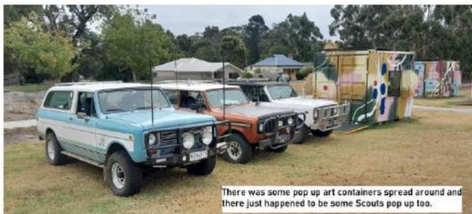
There was some pop up art containers spread around and there just happened to be some Scouts pop up too.

There were some shipping containers fitted out with art and craft, advertised as pop up art so we tried to broaden the Meeniyans public art credentials. Low and behold some Scouts popped up as well to show them some serious Car-Art.