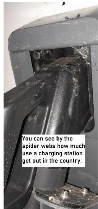
You can see by the spider webs how much use a charging station get out in the country.