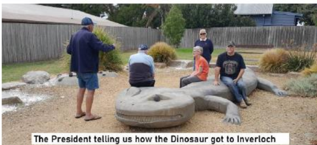
The President telling us how the Dinosaur got to Inverloch